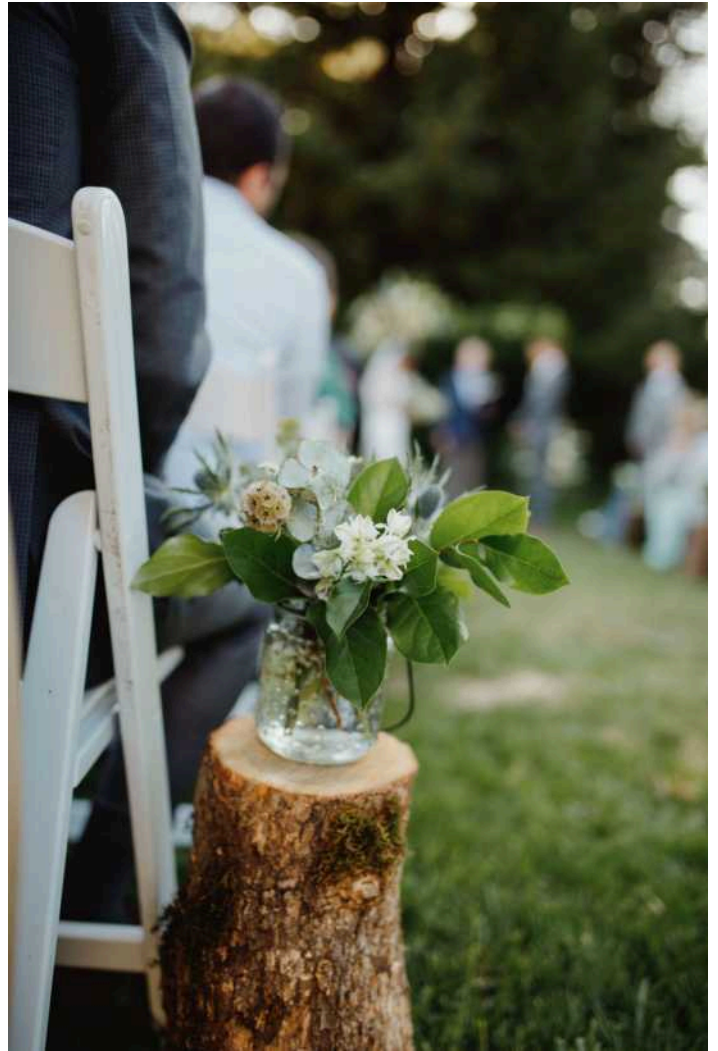
Wooden Stumps (8 available)