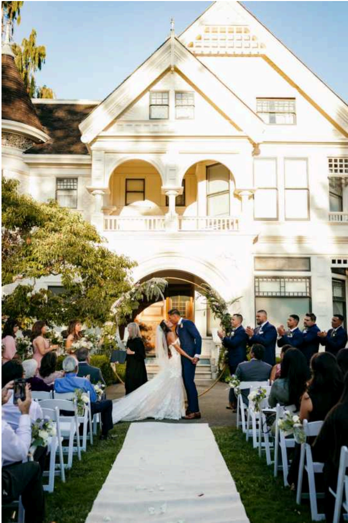
White carpet aisle runner