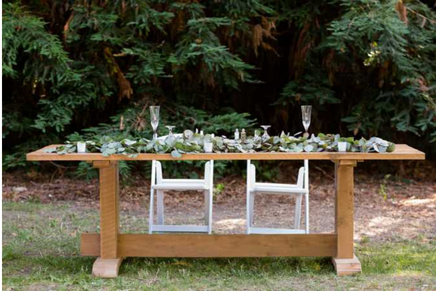
Hand Crafted Wooden Farm Tables